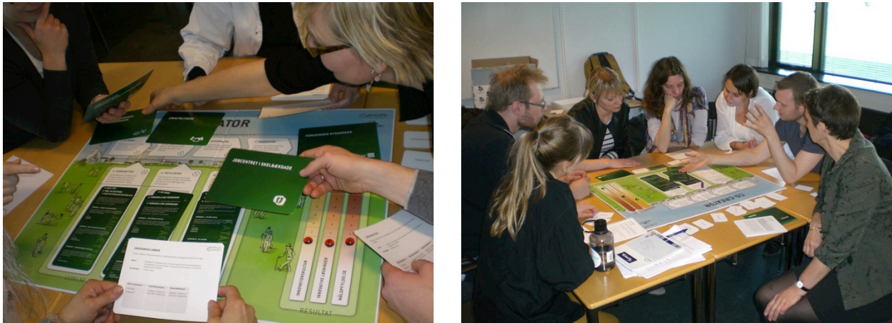
Fig. 4. Gaming sessions to inspire creative thinking in Copenhagen, Denmark