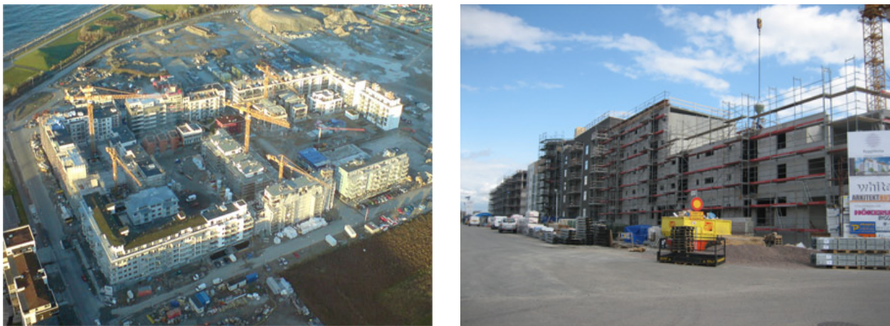
Fig. 2. Urban developments in Malmö, Sweden.

The working approach for the Urban Transitions Öresund project is the analysis of case studies – including existing and planned buildings and districts in the Öresund Region – from which essential lessons are being extracted and subsequently tested on further projects in order to obtain general lessons (see Fig. 2). Importantly, the case studies from the Öresund Region are being supplemented by research on international experiences with a focus on Europe. The workflow for the case studies will use cooperation and implementation methods, which provide both the framework for the process and are simultaneously developed in the process. The total learning achieved will form the basis for developing models and tools for collaboration on sustainable urban transformation.