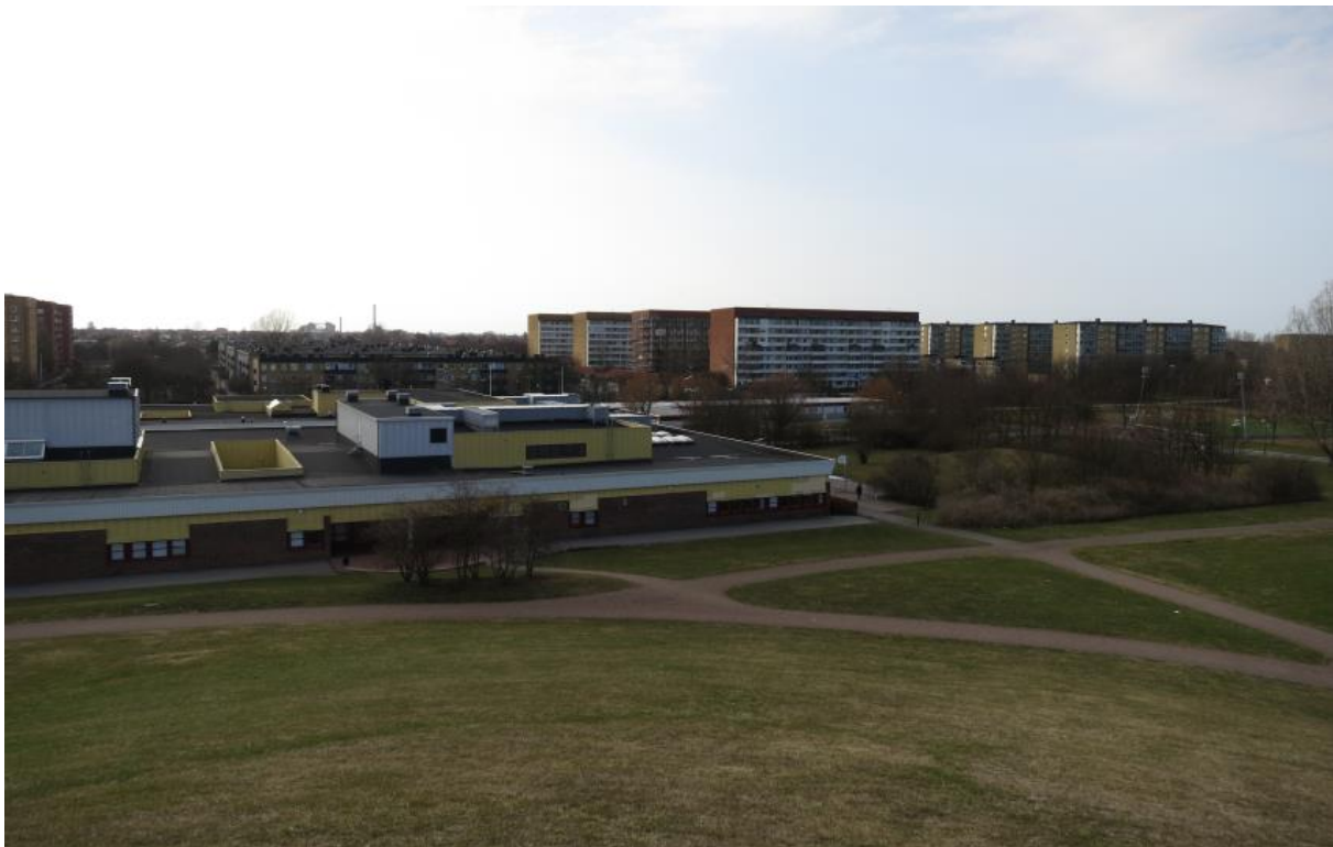
Plate 1: View of Kroksbäck with Kroksbäckskolan in the front (from Kroksbäcksparken).

have an immigrant background. Nowadays, the population is dominated by immigrants with their origins mainly in former Yugoslavia, Albania and Middle East. Compared to Malmö city with 38% in total, the amount is much higher in Holma and Kroksbäck. Furthermore the average level of education in Holma and Kroksbäck is below the merit of whole Malmö. The average income per person for both neighborhoods (Holma: 85,489 SEK; Kroksbäck: 119,597 SEK) is below the average income for whole Malmö (131,052 SEK) (Malmö Stad, 2010, p. 18). The majority of the population lives in 'Hyresrätt' (rental) apartments (Holma 64 %; Kroksbäck 65 %) in two or three room apartments (Holma 72 %; Kroksbäck 80%) (Malmö Stad, 2009, p. 9-13). Due to the high amount of extended families, the problem of overcrowded housing is serious.