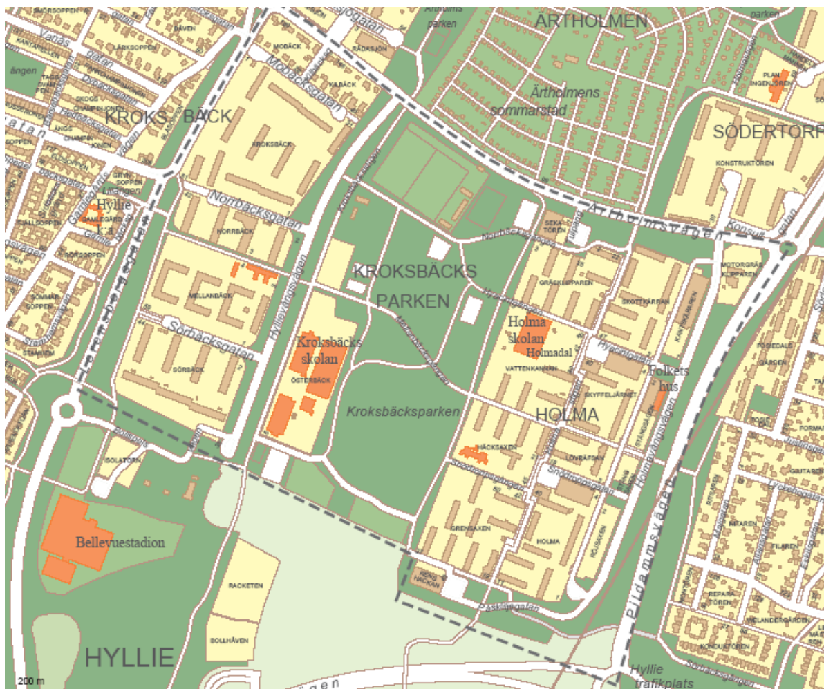
Figure 2: Area of Holma and Kroksbäck.

The neighborhoods of Holma and Kroksbäck have been built in the scope of the Swedish Million Program, which lasted from 1965 until 1975. Kroksbäck was one of the first areas, which were built in this program, Holma arose later in 1971 (Malmö Stad, 2009, p. 9-13). Both neighborhoods are situated in the south of Malmö in the district of Hyllie. The recent modernistic development around the new train station 'Hyllie' and the shopping mall 'Emporia' are located south of both areas. Holma and Kroksbäck are dominated by high rise buildings, large green areas and the Kroksbäcksparken, a big park with artificial hills, which separates the two neighborhoods (Figure 2).