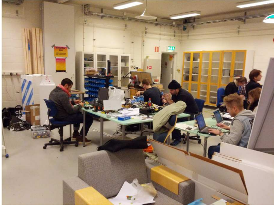
Figure 5. Participants hacking together at CLH (2012).