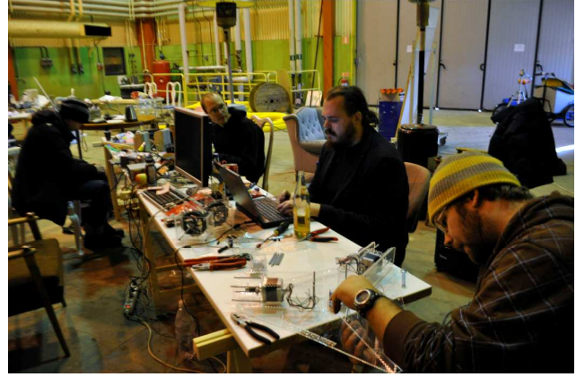
Figure 6. Participants hacking at FH (2011).