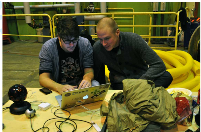
Figure 4. People at work during FH (2011).