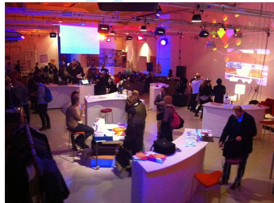
Figure 2. CLH day 1 (2012).