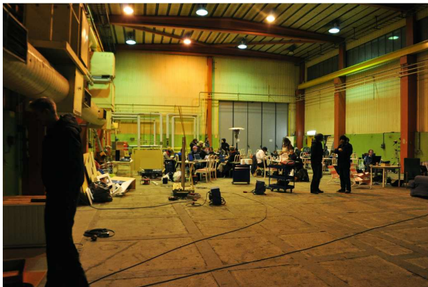
Figure 1. FH day 1 (2011).

The overall impression was that of a very curated space: hip and sexy. A comment gathered from a participant ("I'm very surprised, this is not academia") points out the staged dimension of the event. This comment also gives an idea of an event that is trying to establish a positioning of Connectivity Lab as boundary organization that bridges several domains (the event took place within a university but yet "this is not academia").